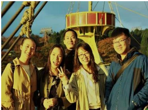
Journey in Hakone with classmates