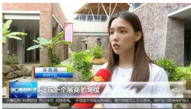
Interviewed by TV station