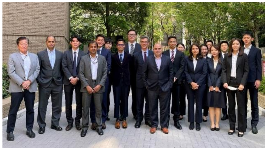
The first and last time I met people from work in person till now.