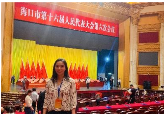
Attending in the people's congress