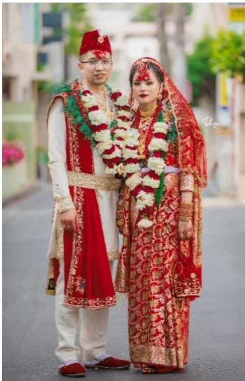
I had a traditional wedding in Tokyo