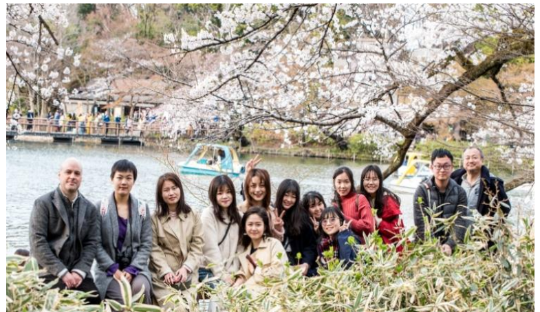
↑ Really miss the teachers and friends in Japan!! ↑