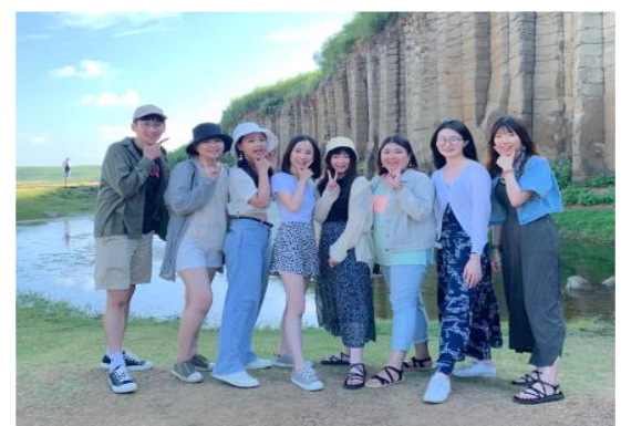
↑ Company trip to Penghu with my EY co-workers.