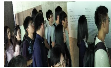
IGSAP school trip to Hakkaisan