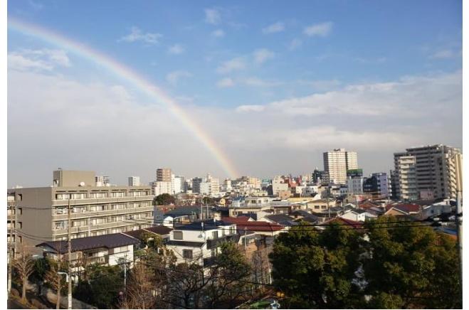
The time when we saw rainbow from Hirai campus