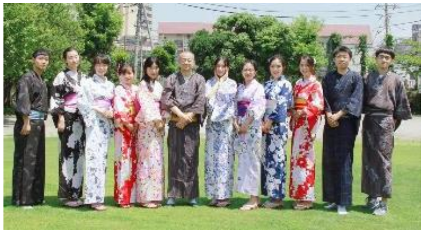
First experience in kimono