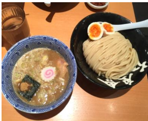
↑ And I miss Japanese FOOD!!