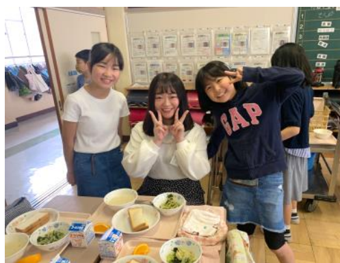
↑ Exchanged culture and language with Japanese students. The kids are sweet and adorable.